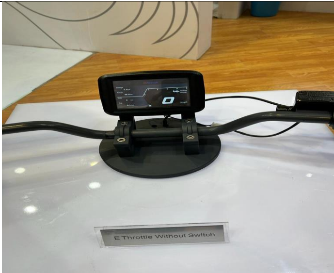
E-Throttle cable without switch