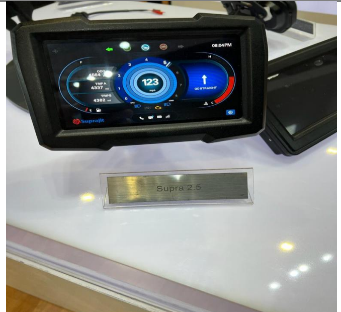
Supra 2.5 – Instrument cluster