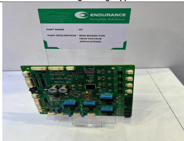
BMS – for high voltage application